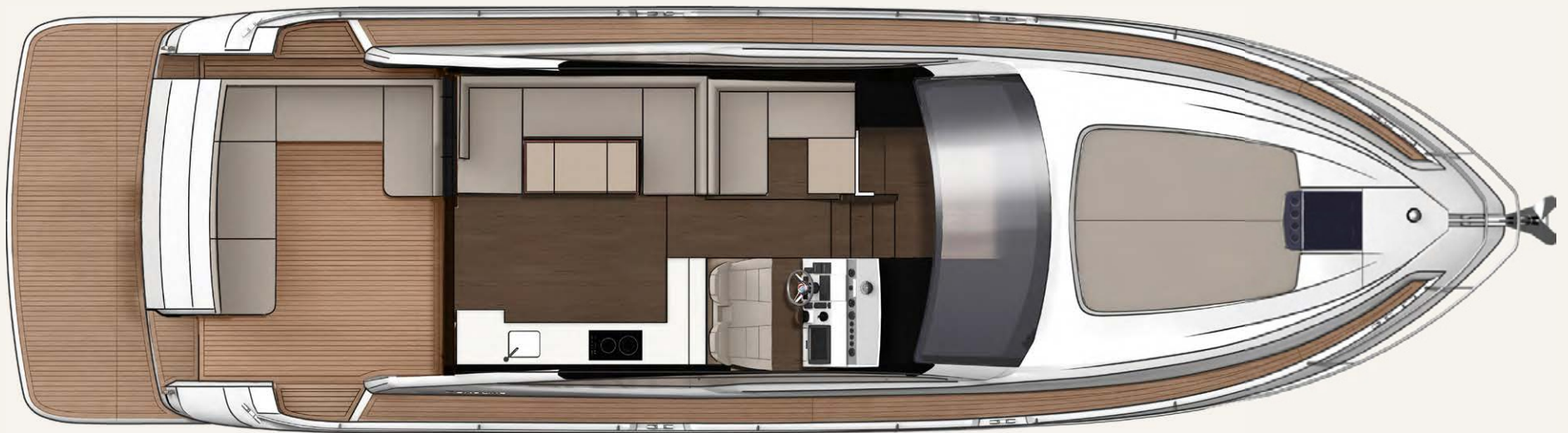
Galley up (cost option)