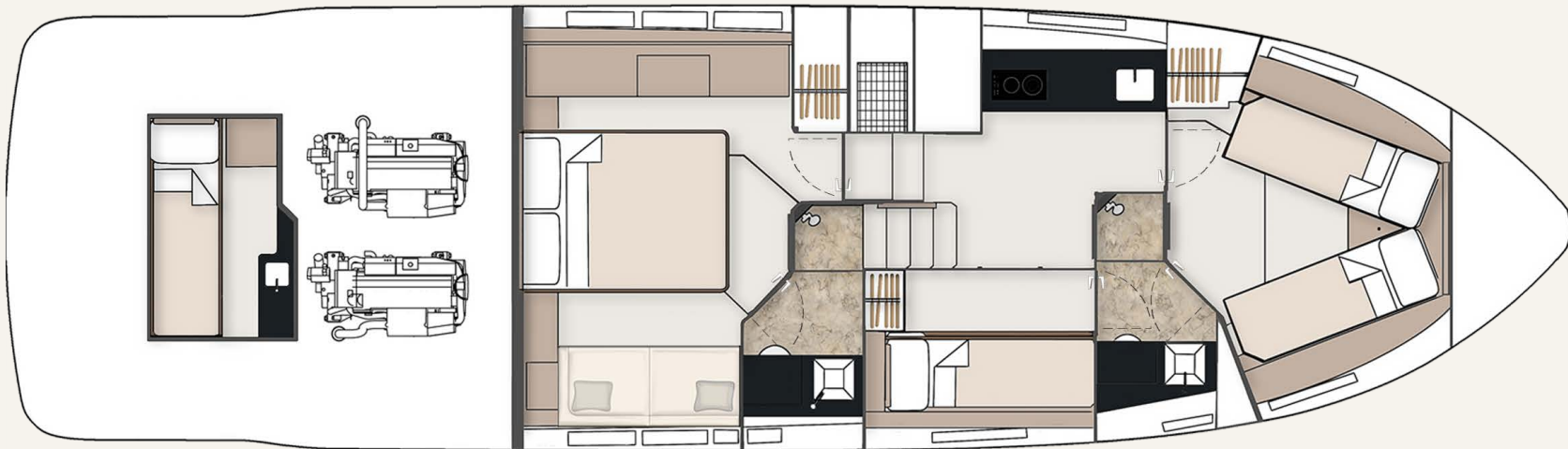
3 Cabin with Single Crew (cost option)