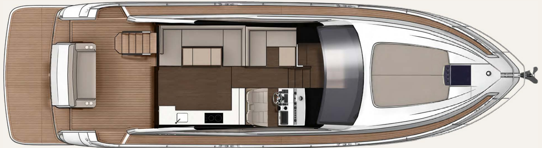
Galley up (cost option)